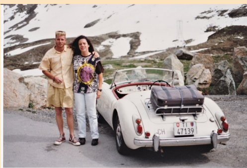
1994 in the Swiss Alps Austria, and Germany.